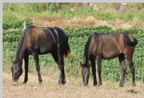
Two Lusitano Colts - Damasco & Coco

www.emergosol-lusitanos.com Tel: 261 933 351 Email: geral@emergosol.com We have four foals due soon for 2010