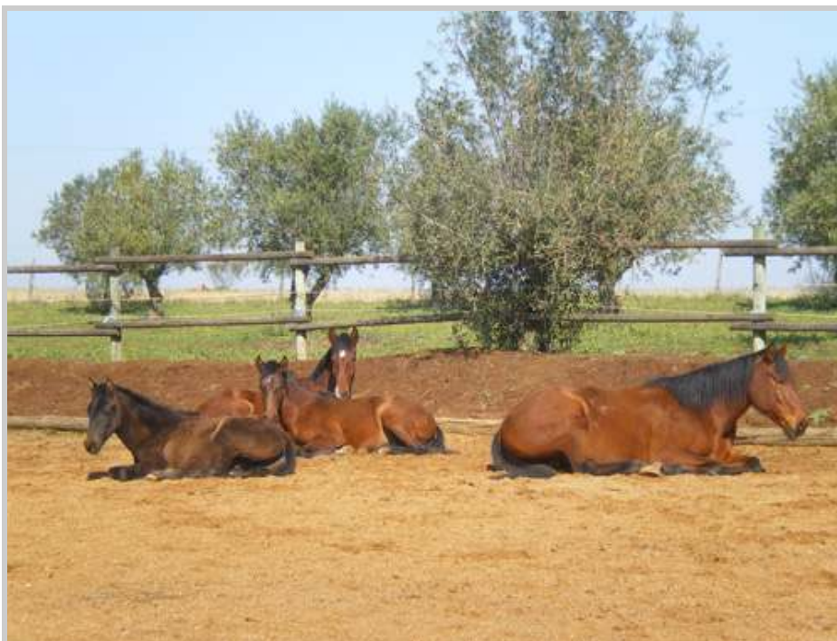
Oh...lovely sunshine.... Taken in the Alentejo in March 2010