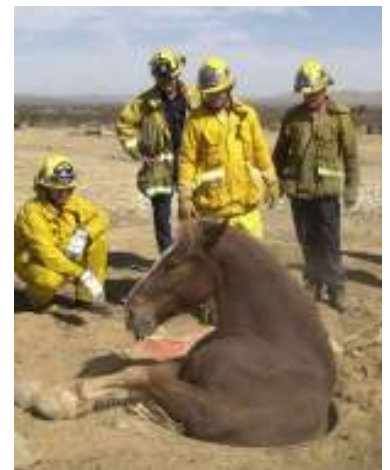
This horse was rescued safely!

(Zoloft = American drug used to treat depression!)