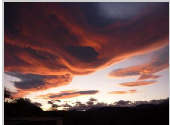
Stormy skies Photo taken in January 2010 in Spain